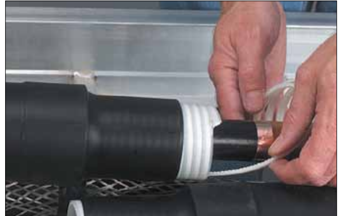
2. Position splice and unwind core