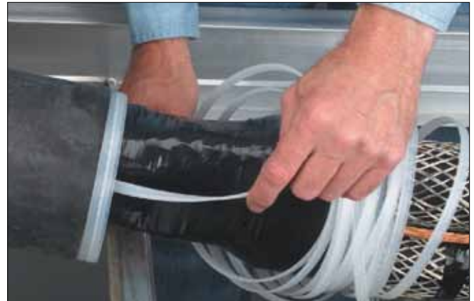
4. Re-jacket Splice